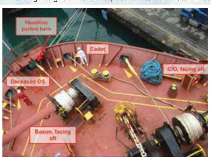
Reconstruction of accident site showing location of persons

The Master then instructed the C/O to send out the forward lines. While the cadet, OS and the trainee were lowering the forward backspring and a headline through the centreline panama chock, the Bosun, facing aft, operated the winch controls located inside the fore peak store access trunk. The C/O was standing on the starboard bulwark platform and directing the team with hand signals. As the vessel was required to move 10 metres astern, the Master instructed the C/O and 2/O to keep the headline and aft spring slack. The C/O started to heave on the forward backspring and, after the sternlines were ashore, both mooring parties were warping the vessel astern with the C/O estimating that the headline had just the right slack to stop the vessel at the desired location. He also informed the bridge that the TS and OS were passing the two other headlines from the port side of the forecastle. When the vessel reached her intended final position, the Master instructed the C/O and 2/O to start taking weight on their respective head and sternlines